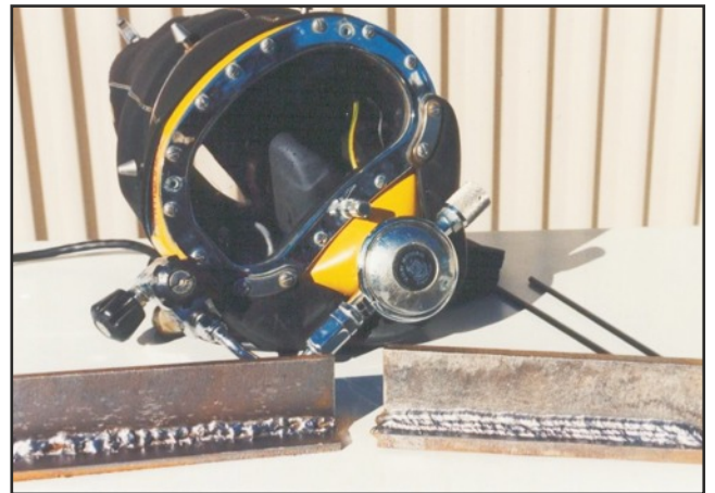
Example of a students work, before & after training